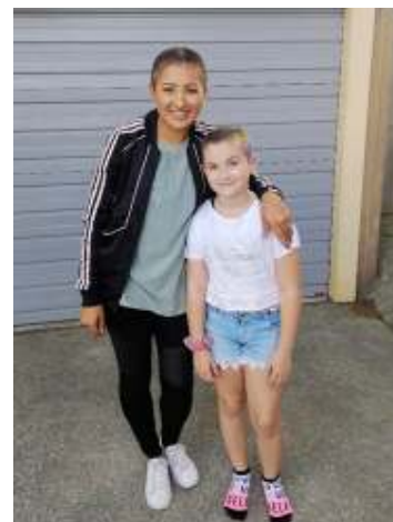
After the shave!