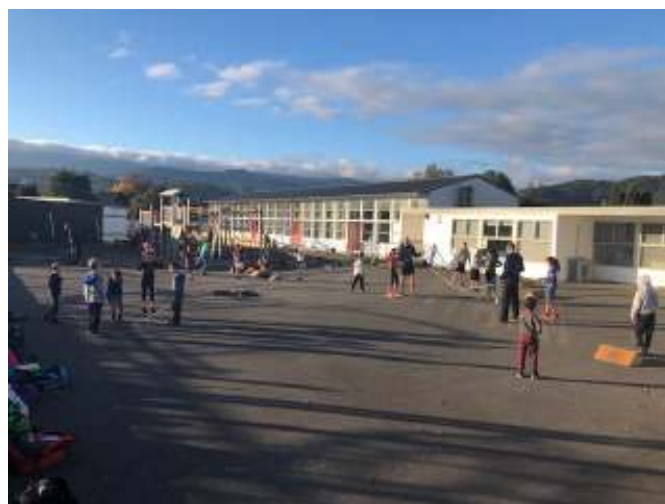
Active Adventurers session. Even Double Dutch!