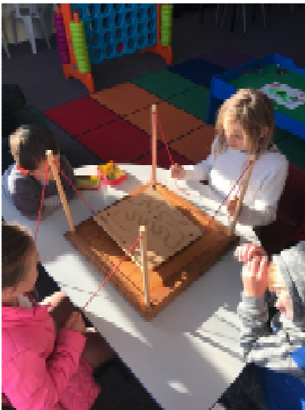
Games in the Hub.