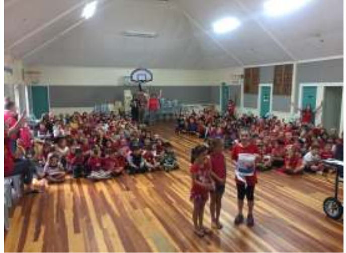
A couple of pictures from our Little Heart Day fundraiser.