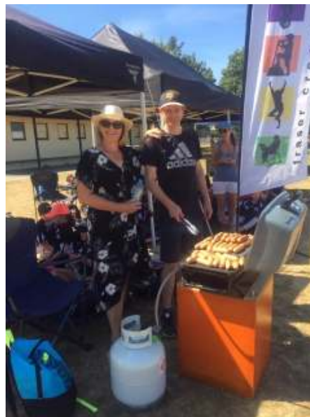
Danish Rounders BBQ