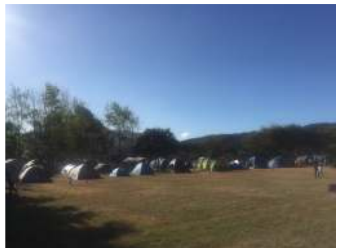
The Fraser Crescent School Holiday Park!